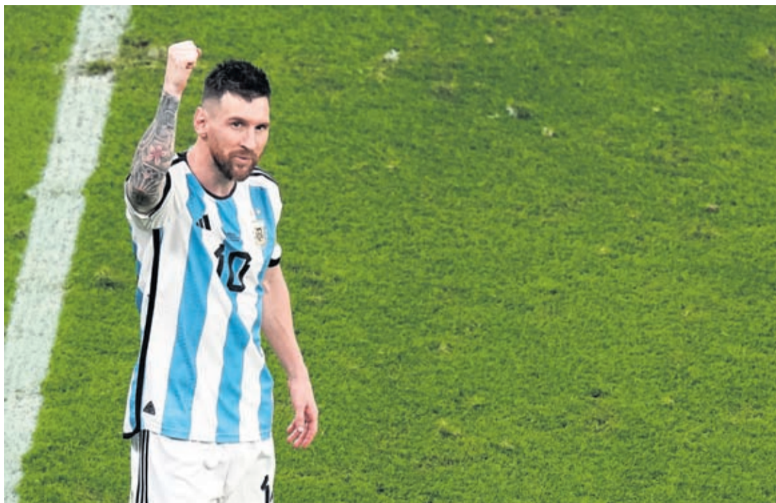
Argentina's Lionel Messi celebrates at the end of the World Cup semifinal soccer match between Argentina and Croatia at the Lusail Stadium in Lusail, Qatar, Tuesday, Dec. 13, 2022.

"Each time we see him play, he makes us and the players feel something special," Argentina coach Lionel Scaloni said. "There's something about him that